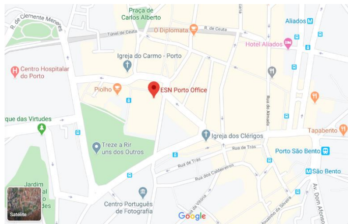
Map 1. ESN Office Location

General Info: info@esnporto.org Buddy Program: buddy@esnporto.org