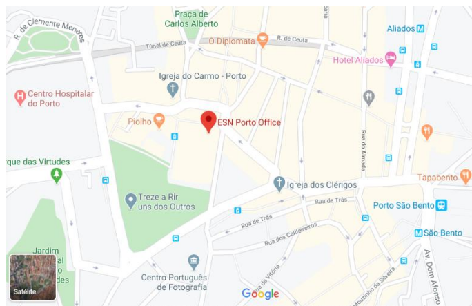
Map 1. ESN Office Location