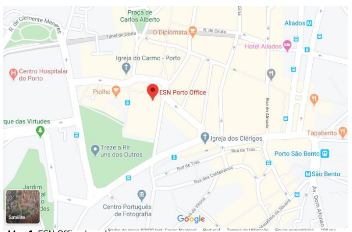
Map 1. ESN Office Location

General Info: info@esnporto.org Buddy Program: buddy@esnporto.org